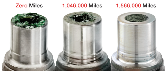
Real-life examples of high-mileage U-joints show virtually no wear.